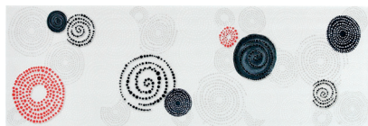
Stripes Negro Decor* 20x59,2 cm C-350