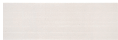
Stripes Blanco 20x59,2 cm C-490