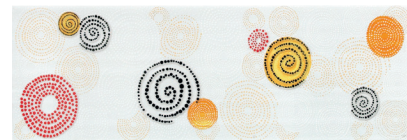
Stripes Maiz Decor* 20x59,2 cm C-350