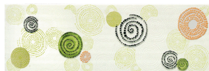
Stripes Pistacho Decor* 20x59,2 cm C-350